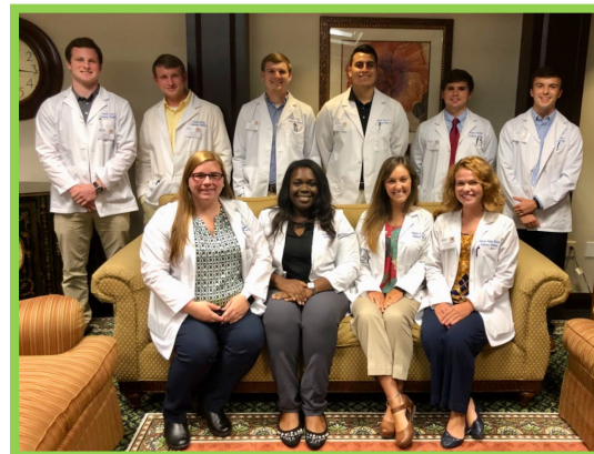
PATHWAY CLASS OF 2018

Atkinson Colquitt Lanier Sumter Bacon Cook Lee Terrell Baker Crisp Lowndes Thomas Ben Hill Decatur Miller Tift Berrien Dooly Mitchell Turner Brooks Dougherty Pulaski Webster Calhoun Early Quitman Wilcox Clay Echols Randolph Worth Clinch Grady Seminole Coffee Irwin Stewart