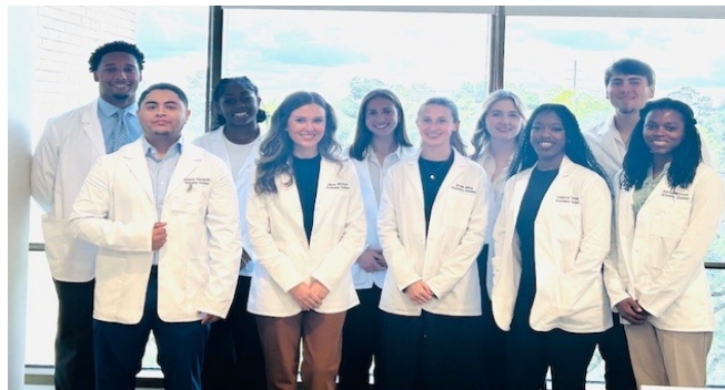
PATHWAY CLASS OF 2025

PATHWAY TO MED SCHOOL 1512 WEST THIRD AVENUE ALBANY, GA 31707 229-439-7185