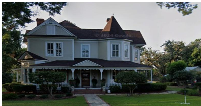
412 W Tift Avenue, Albany Ga. 31701